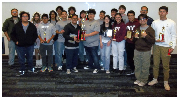
6A Second Place Sweepstakes: Edinburg North