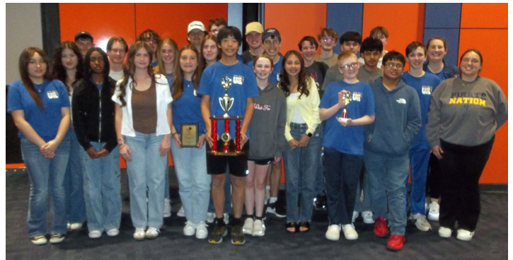
4A Second Place Sweepstakes: Pine Tree