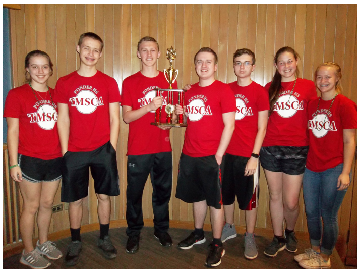
3A Second Place Sweepstakes: Ponder.