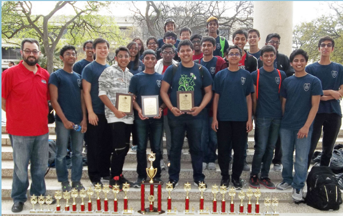
6A First Place Sweepstakes: Dulles.