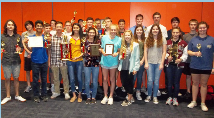
4A First Place Sweepstakes: Argyle.