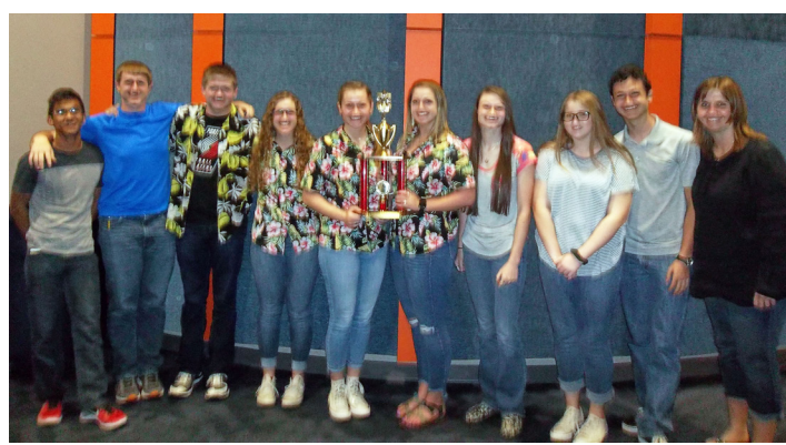
1A/2A Second Place Sweepstakes: Sundown.