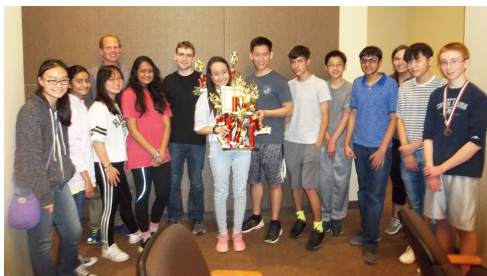
5A Second Place Sweepstakes: Lubbock.