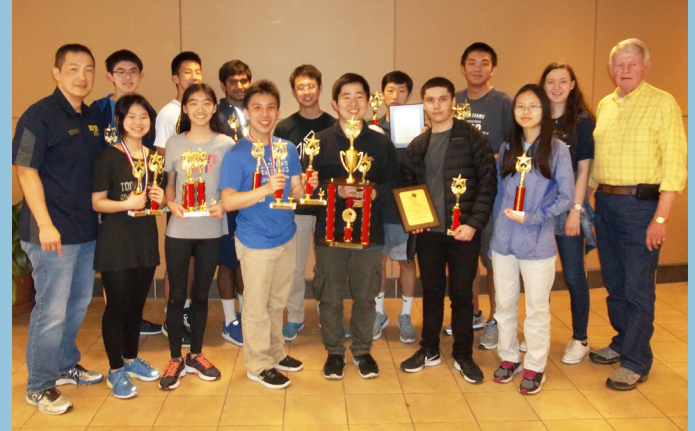
5A First Place Sweepstakes: Highland Park.